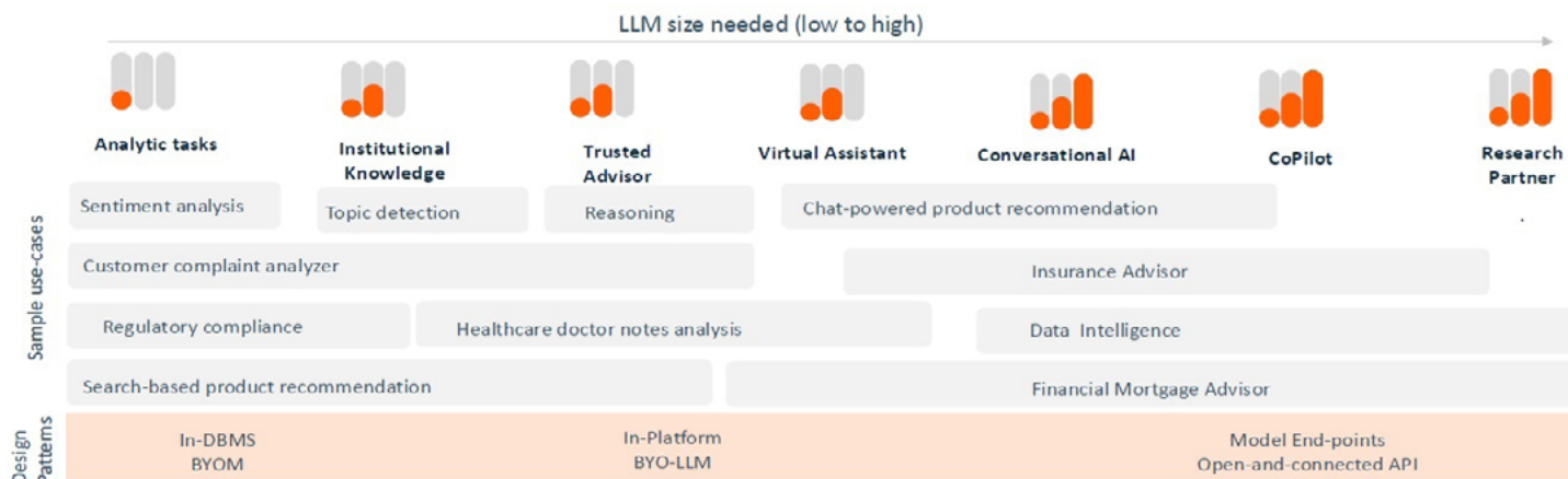
Figure 4. Teradata Believes That Customers Will Need To Address a Variety of Use Cases Requiring a Variety of Model Types and Sizes