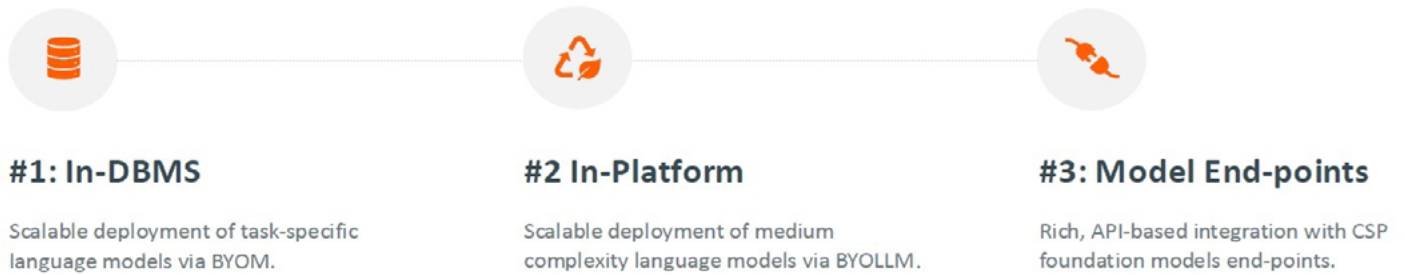
Figure 2. Teradata Enables Customers To Apply Models to Data Analysis Through Three Design Patterns: In-Database (DBMS), In-Platform, and via APIs